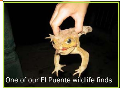
One of our El Puente wildlife finds

We've recently gotten a Vonage phone line, and can now be reached at US long distance rates @ (434)-227-4917. We'd love to hear from you. Finally, thank you for your participation and all your prayers.