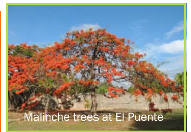
Malinche trees at El Puente