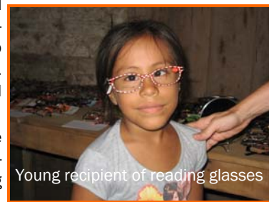
Young recipient of reading glasses