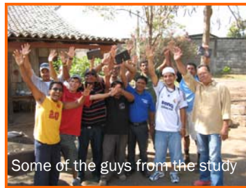
Some of the guys from the study