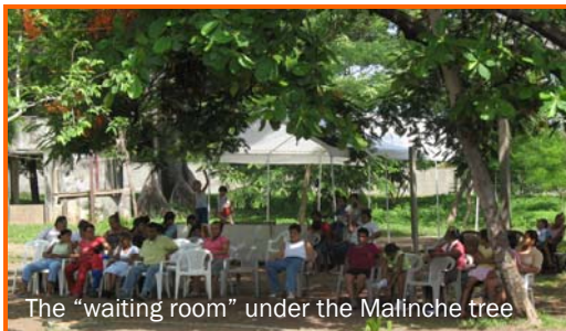
The "waiting room" under the Malinche tree